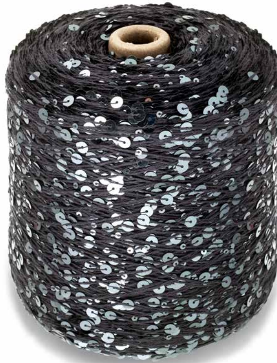
Example of effect yarn: Sequin yarn